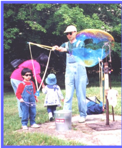
Making huge bubbles was always fun.